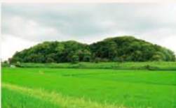
The mausoleum of Emperor Suinin map26J