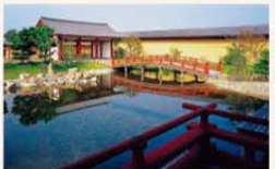
Heijo Palace Site (To-in Hall Garden) map25K

The Site of Heijo Palace was declared as a UNESCO World Heritage site (cultural heritage) under the name of "Historic Monuments of Ancient Nara". Today the Suzaku-mon Gate, the main gate to the palace, Toin Teien Garden, and the First Daigokuden hall (the central audience hall) have been restored, allowing visitors to imagine what the ancient capital looked like in those days. Heading South on Sahogawa-river, Toshodai-ji Temple and Yakushi-ji Temple, two temples representative of the Nara Period, can be seen on the peaceful countryside. You can experience the Tenpyo culture from the past and relax.