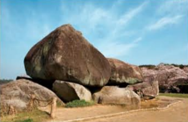
Ishibutai Burial Mound map41M

Asuka area is located at the southern end of this cycling route, and is the place where the history of ancient Japan began. Many historical sites such as the palace site of the Asuka period were discovered in the peaceful countryside. This area fascinates many visitors because of the ancient historical sites which lie beneath the ground. The countryside scenery, and perhaps the thought that this was the place where the nation started, also make visitors feel nostalgic.