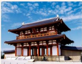
Heijo Palace Site Suzakumon map25K

The Site of Heijo Palace was declared as a UNESCO World Heritage site (cultural heritage) under the name of "Historic Monuments of Ancient Nara". Today the Suzaku-mon Gate, the main gate to the palace, Toin Teien Garden, and the First Daigokuden hall (the central audience hall) have been restored, allowing visitors to imagine what the ancient capital looked like in those days. Heading South on Sahogawa-river, Toshodai-ji Temple and Yakushi-ji Temple, two temples representative of the Nara Period, can be seen on the peaceful countryside. You can experience the Tenpyo culture from the past and relax.