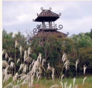
Karako-Kagi site map33K

Villages during the Yayoi period were largely established in the central area of the Nara Basin, where the Karako-Kagi Historical Site is located. This area is where enormous moated settlements were located, and is thought to have been the epicenter of the Yayoi period and culture. From Koryo-cho, Kawai-cho and Yamatotakada City southwest of the Nara Basin to Umami Hill, many major historical sites can be found in the area, and you can experience and imagine the past as you walk over the historical ground beneath your feet.